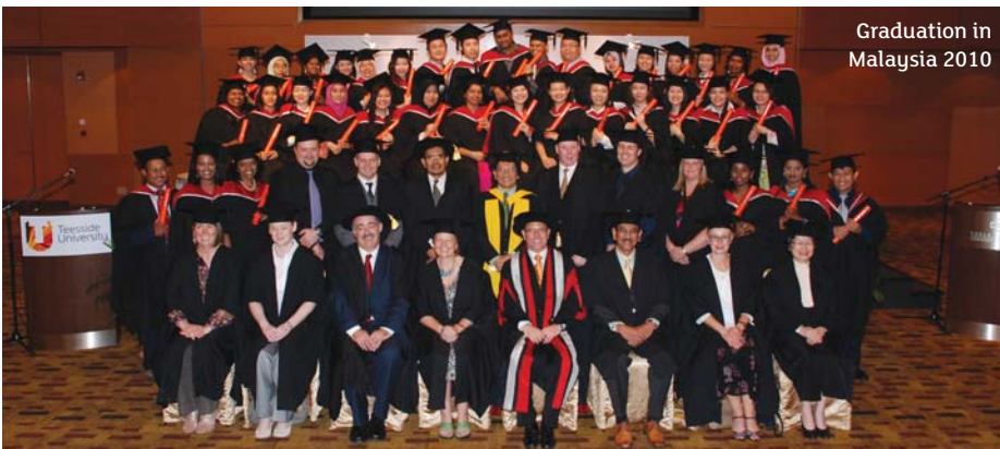
Graduation in Malaysia 2010

In the future this successful and constructive partnership will focus on an articulation between the Physio-Akademie's Orthopaedic Manual Therapy programme and our MSc Advanced Clinical Practice programme Manipulative Therapy Pathway.