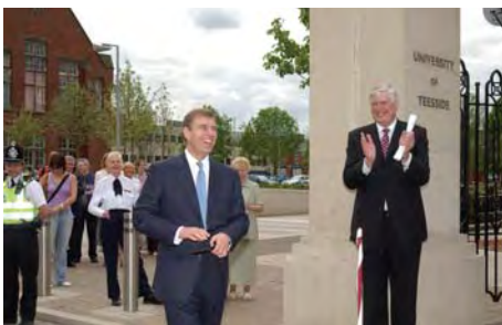
The Duke of York officially opens the University Gateway.