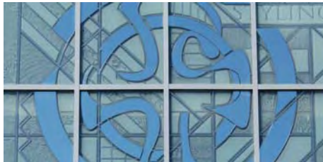
Psyche, Linthorpe Road.

The Middlesbrough shopping experience has exploded over the last decade. The Hill Street Shopping Centre has undergone a £9 million refurbishment and extension, The Mall - Middlesbrough (formally the Cleveland Shopping Centre) will be investing around £20 million on internal improvements and will be welcoming H&M and George as new retailers to the town. The Dundas Shopping Mall has also benefited from improvements and the most recent shopping addition, Captain Cook Square, boasts a great range of shops. Linthorpe Road Central area has fast become the designer area of the town centre and includes the award-winning designer department store Psyche. This location is also home to numerous other designer stores plus great bars and restaurants.