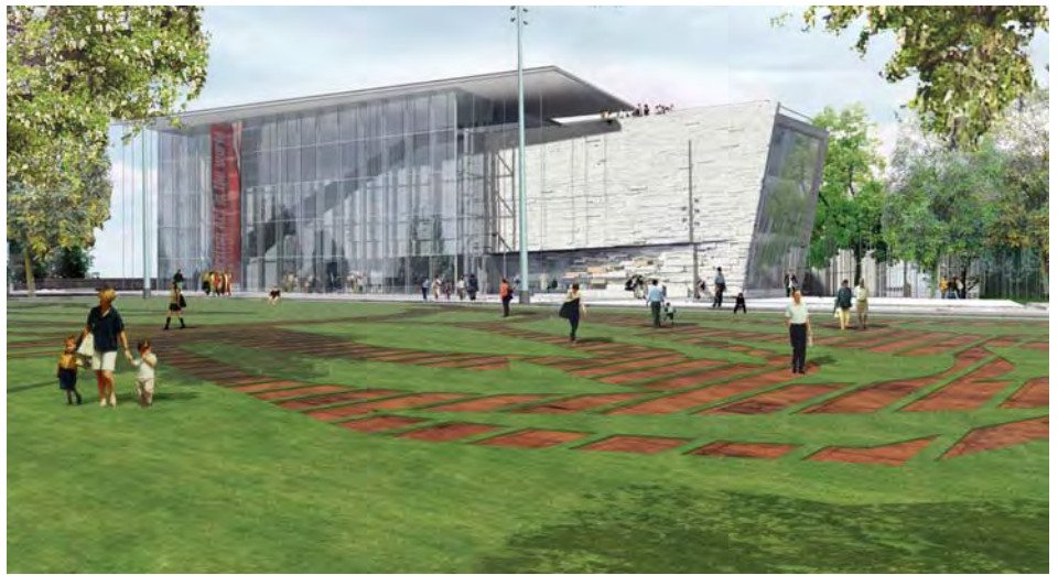
Artist's impression of the new Middlesbrough Institute of Modern Art.

Middlesbrough town centre has undergone significant developments and currently one of the council's most ambitious projects - the new Middlesbrough Institute of Modern Art (mima) - is under construction. Work began in the summer of 2004 and the gallery is expected to open later this year. It is the centrepiece of the redevelopments of Victoria Square and will host internationally acclaimed exhibitions.