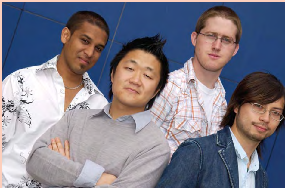
MoShine, winners of the best new company award at the Digital Fellowships 2005.

Nearly 300 new jobs and 130 new companies will be created by 2010 as the result of the Institute of Digital Innovation (IDI) to be built by the University with support from One NorthEast.