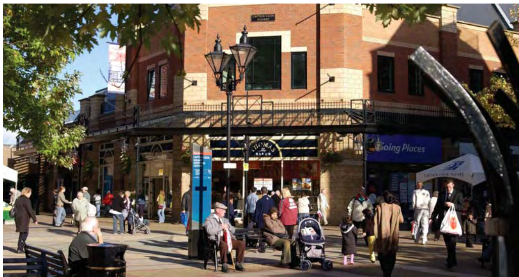
Captain Cook Square.

The Dorman Museum has been extended and there have been major improvements to Albert Park. The University has also developed KINO cinema, in partnership with Ten Feet Tall, which shows a broad range of movies from classics to recent releases. Screenings are on the University campus and are open to the public.